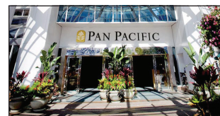
Pan Pacific Hotel