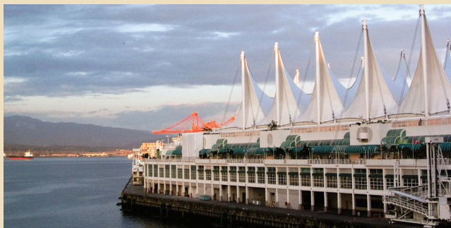
The Vancouver Convention Centre East